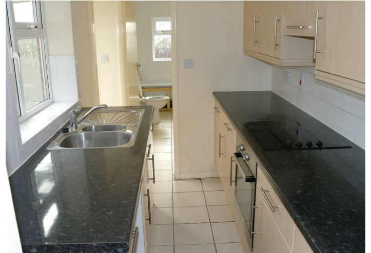
14 Colthrop Cottages, Berkshire £725 PCM